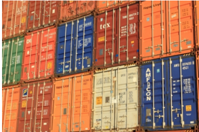
SHIPPING & LOGISTICS